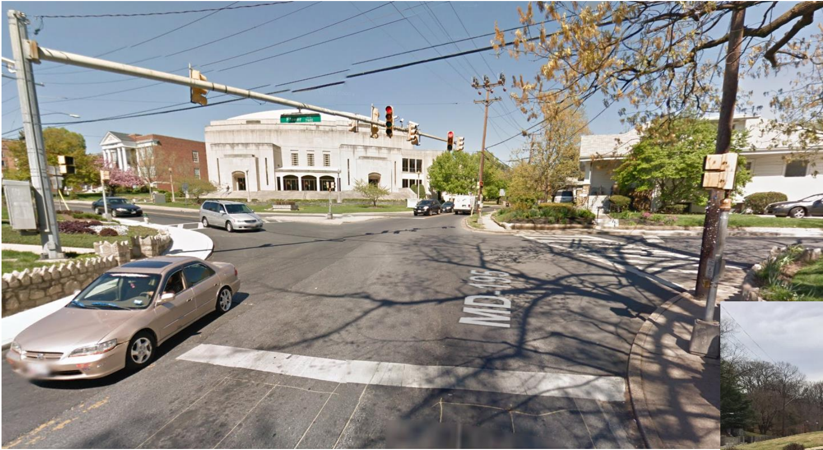
Carroll Ave/Flower Ave intersection

Poor design/absence of signage or markings